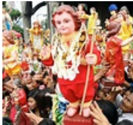
SANTO NIÑO (THE HOLY INFANT JESUS)

The most revered image in the Philippines – Santo Niño de Cebú is an image of the Child Jesus much venerated as miraculous by the majority of Filipino Catholics and revered as the symbol of the Catholic Faith in the country. The oldest Christian image in the Philippines, it was originally given in 1521 as a baptismal gift by Portuguese explorer Ferdinand Magellan to Hara Humamay, the chief consort of Rajah Humabon, along with a statue of the Virgin Mary, and a bust of depicting Christ as Ecce Homo.