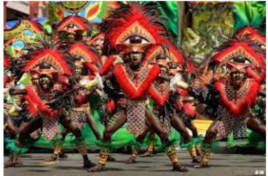
Ati-Atihan in Aklan