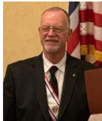
Grand Knight Council #10577