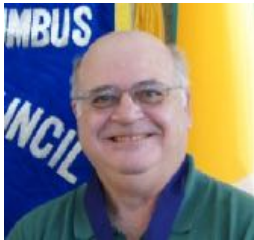
Grand Knight Council #4928