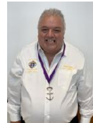
Grand Knight Council #12877

Ponderosa Council #4928 St. Michael the Archangel Council #10577 Our Lady of the Desert Council #12877