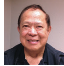
State Family Program Director