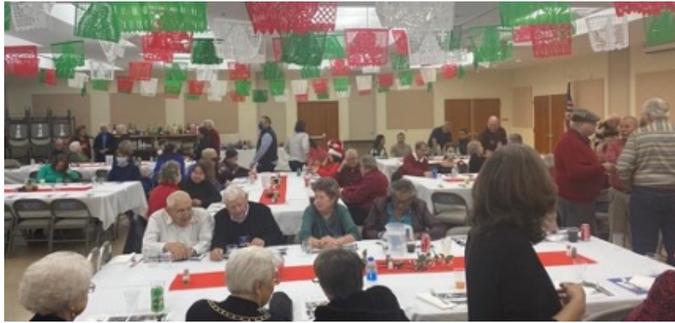
The Cocktail Hour – Sixty Minutes of Holiday Spirit(s)

The economic benefits of a tri-council Christmas dinner party were irrefutable. It turned out that hosting a New York Strip steak dinner with all the fixin’s would run 40% of that of local area dining venues with a no host bar. In addition, participating councils had enough beverage in storage to host the dinner with an open beverage bar. Cheers!