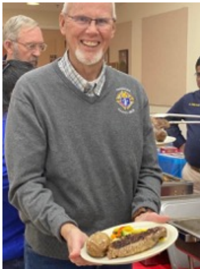
On the Way to the Salad Bar and Then the Dessert Station