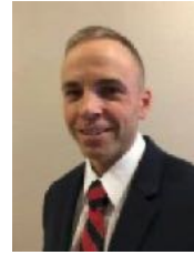
State Warden & Program Director