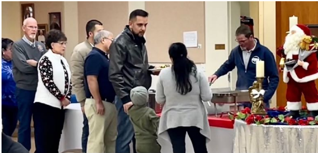
Steak It, and They Will Come

The economic benefits of a tri-council Christmas dinner party were irrefutable. It turned out that hosting a New York Strip steak dinner with all the fixin’s would run 40% of that of local area dining venues with a no host bar. In addition, participating councils had enough beverage in storage to host the dinner with an open beverage bar. Cheers!