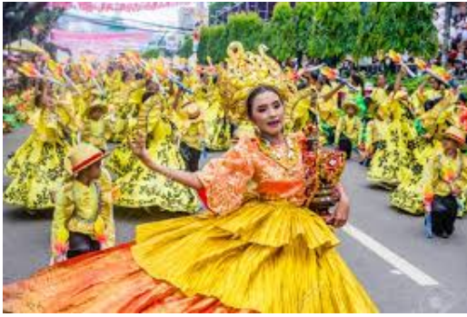
Sinulog in Cebu City